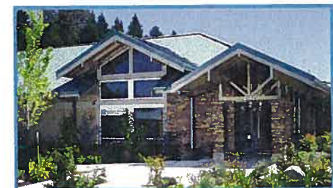
Sunrise Imaging Center 11212 Sunrise Blvd. East, Suite 200 | Puyallup, WA 98374