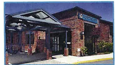
Puyallup Imaging Center 222 15th Avenue SE | Puyallup, WA 98372