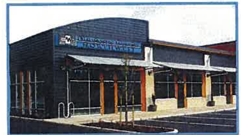
Bonney Lake Imaging Center 21110 SR 410 East, Suite 110 | Bonney Lake, WA 98391

To join simply call: (253) 841-4353 Or sign up online at www.MyDINW.com